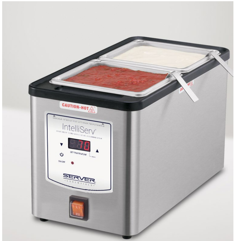
Shown: 1/6-pans and ladles