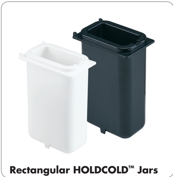
Rectangular HOLDCOLD™ Jars