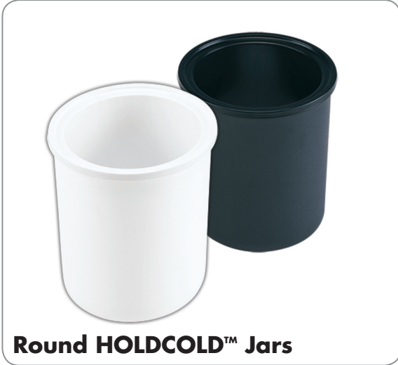
Round HOLDCOLD™ Jars