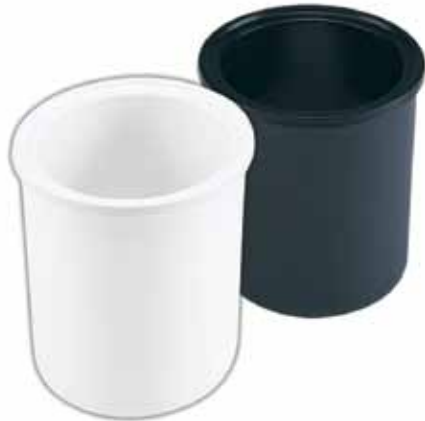
Round HOLDCOLD™ Jars