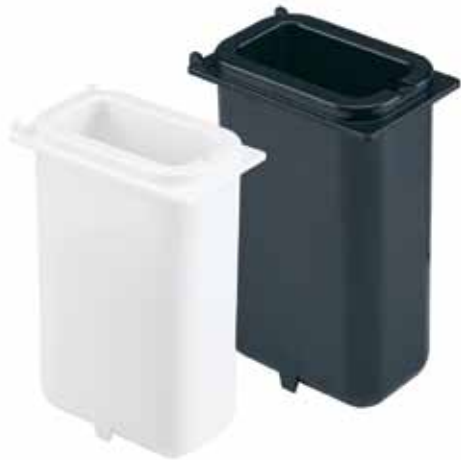
Rectangular HOLDCOLD™ Jars