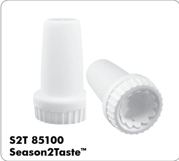
S2T 85100 Season2Taste™