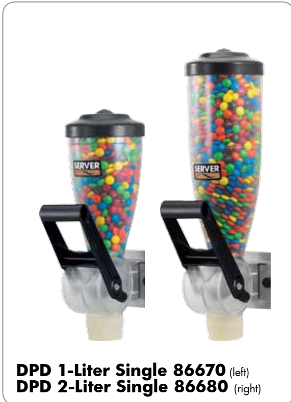
DPD 1-Liter Single 86670 (left) DPD 2-Liter Single 86680 (right)